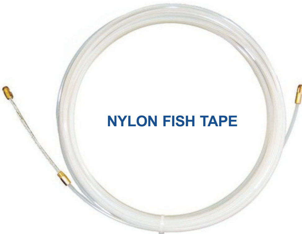
NYLON FISH TAPE