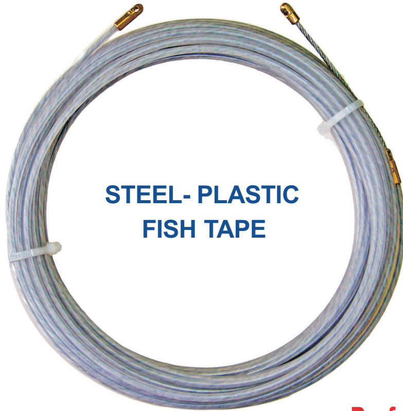
STEEL- PLASTIC FISH TAPE