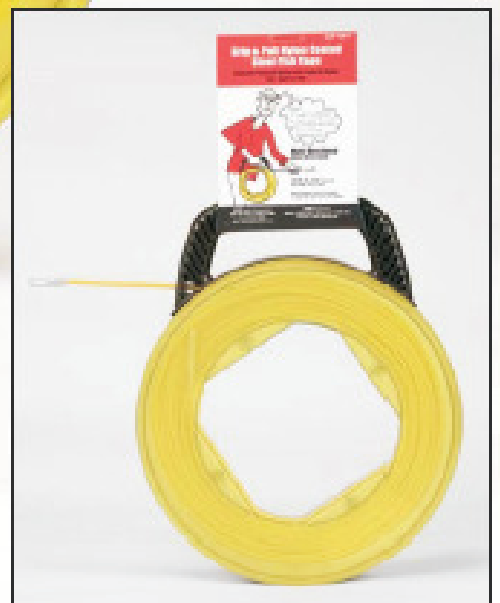
Steel Fish Tape hanging display