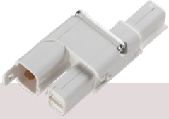
C3D 1 in / 2 out