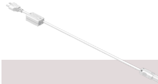
US Starter Lead