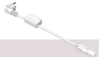
Schuko Starter Lead