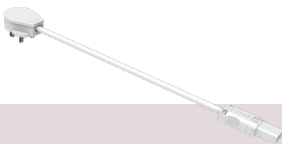
Indian Starter Lead