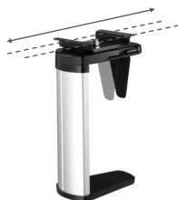
Under desk slide function

The CPU30 holder effectively raises the CPU tower off the floor and stores the CPU in a safe position under the work surface, therefore protecting your equipment and saving room on your desktop. The rack allows the CPU to work on a sliding system and rotates a full 360° providing easy access to cables and ports. This versatile holder is constructed from Aluminium to secure your CPU tower.