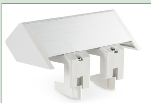
Quick-Fit Desk-Clamps Features Self-Fastening Paddles For Easy Top-Side Mounting.