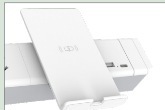
Helistand 15W Integrated Wireless Charger