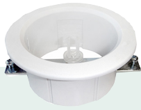
AXCDWT In-desk flange (White Only)