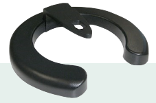
AXB Horse Shoe Base with Joiner