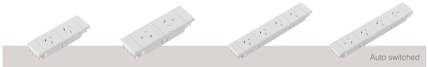
SW1802 Dual GPO

The SW18 series is available in a wide range of configurations including switched, round earth and rotated.