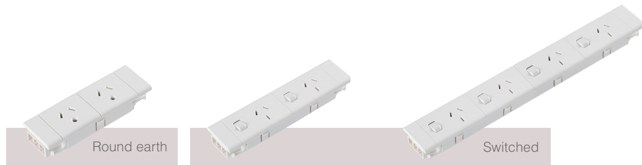
SW1802A Dual auto switched round earth pinpower module