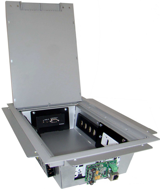
Access floorbox shown with AV plates fitted

The CMS Titan floorbox has been designed for maximum flexibility incorporating power, data and AV to suit client requirements.