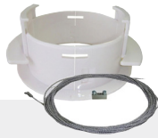
AXC Ceiling flange