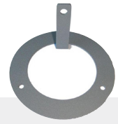
SPTDB Under desk mounting bracket