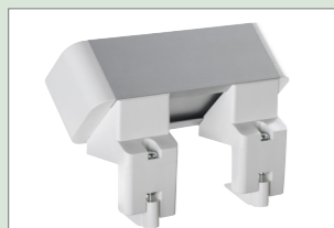
Quick-fit desk-clamps Features self-fastening paddles for easy top-side mounting.