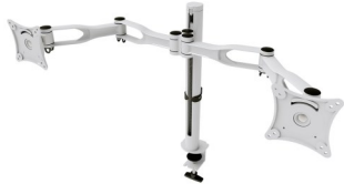
Elevate Monitor Arm