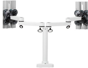
Easy Fly Monitor Arm