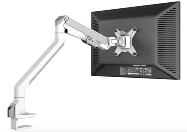
Dynamo Monitor Arm