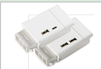
Inline 30W and 65W USB-A/C Charging Modules