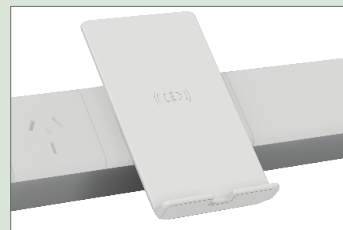
Heli-stand 15W integrated wireless charger.