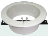
AXCD In-desk flange