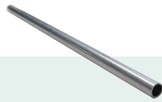
AXP Anodised Aluminium Rod