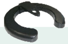
AXB Horse Shoe Base with Joiner