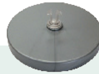
AXG Round Disc Base with Joiner