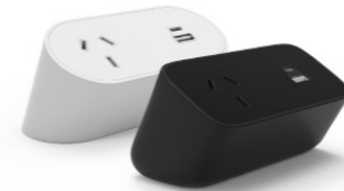
Nova & Viva Power Rail