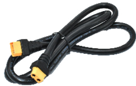
XT60 Plug to XT60 Socket