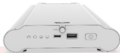
FR210PB - Power Bank