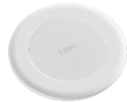
Echo Wireless Charger

The FR210 Power Bank provides DC Power and once connected to the Docking Station, it provides the ability for certain products to be powered using the 2x DC Output's located at the back of the docking station rather than needing an inverter to convert the power to AC. Specific XT60 leads can be provided to be connected from the Docking Station to one or more products listed below.