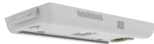
FR210DS - Docking Station