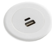
Echo USB A/C Charger