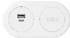
Echo USB A/C + Wireless