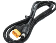
XT60 Plug to DC Jack