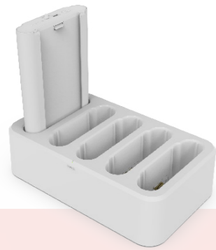
FR210CS - Charging Station

It is capable of streaming up to 24V DC and/or 100W USB-C PD so if you're looking for a high-capacity high-output portable power solution, without the need to plug cables into walls, then look no further than the Freedom FR210 Series.