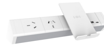
Athena Power Rail