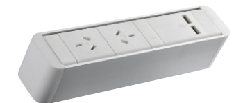
Zeus Power Rail