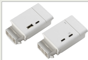
USB Charging USB Inline Charging Modules