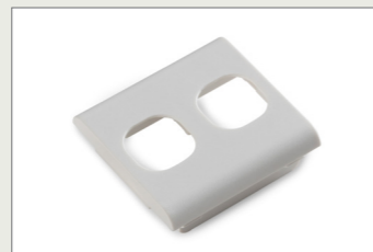
Data Thin Panel Mounting Data Plates