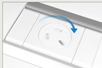
GPO Auto Switched Power Module