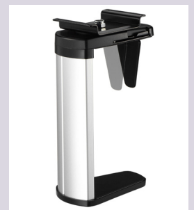
Underdesk slide function