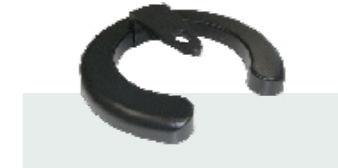
CQB Floor base c/w joiner