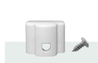
CXD Mounting foot under desk