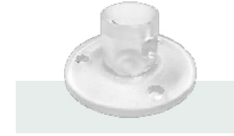
CQD Mounting foot