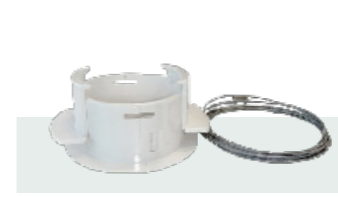
CQC Ceiling flange, 2.0m hanging wire and terminal block.