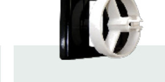
CQW Wall mounted base with joiner