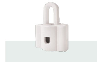
CQH Top hook for false ceiling mount (white only)