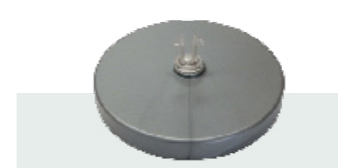
CQG Round disk base with joiner.