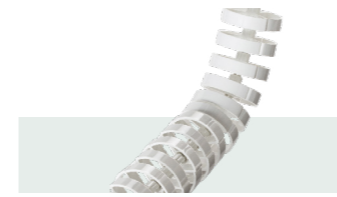
CQ70 Cirqlate 700mm section