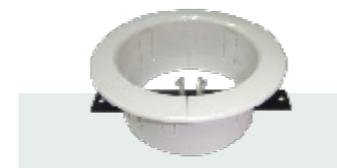
CQCD Cirqlate in-desk flange with under desk mounting bracket