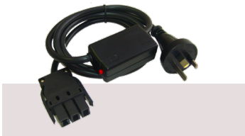
SWT5 3-pin starter leads 10A 3-pin starter into 20A TAG connector