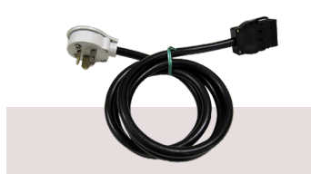
SW552 3-pin starter leads HPM 20A 3-pin starter into 20A TAG connector (suit HPM 20A GPO only)