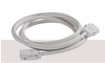
SW52 TAG interconnecting leads Standard