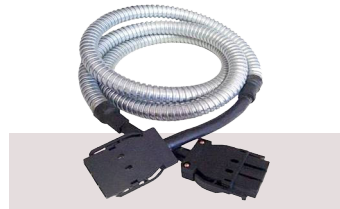
SWSE52 TAG interconnecting leads Steel conduit