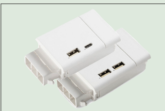
Inline USB-A/C 30W/65W Charging Modules