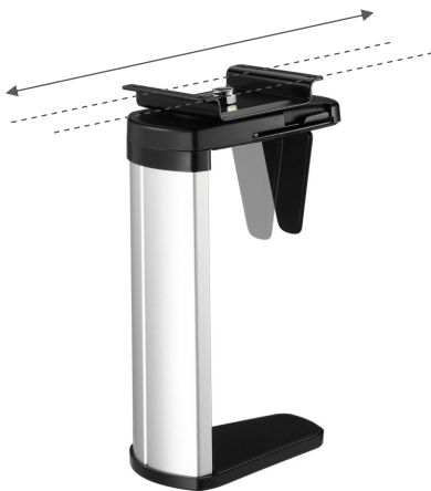
Under desk slide function