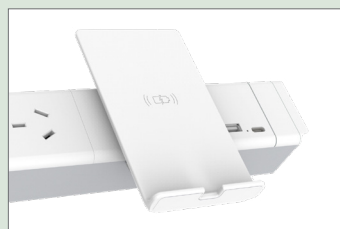
Helistand 15W Integrated Wireless Charger

Quick-fit desk-clamps Features self-fastening paddles for easy top-side mounting.