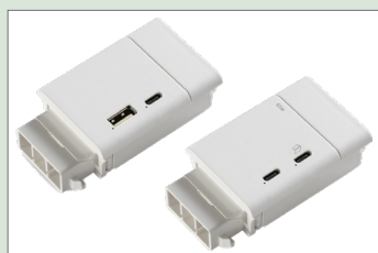
Inline USB Charging Modules.