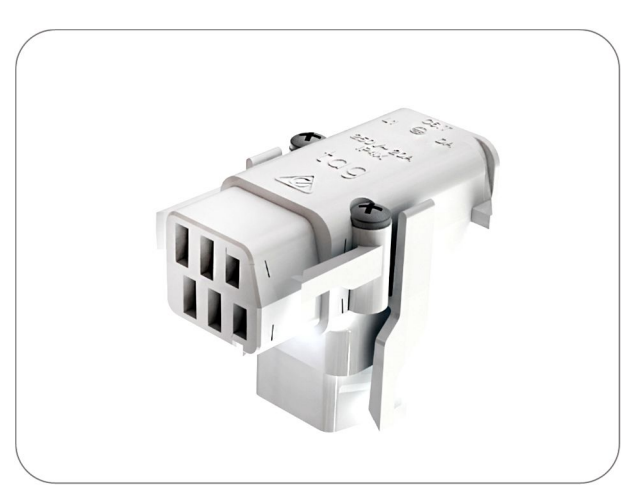
C6T: 'T' Adaptor 1-In 2-Out C6 Connector