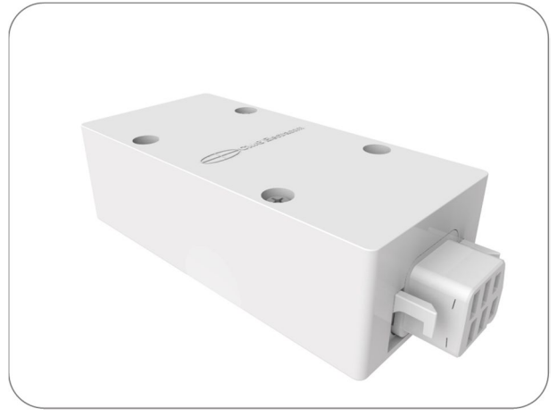
QC1: Starter socket - Transition between hard and soft wiring tunnel terminals to socket.