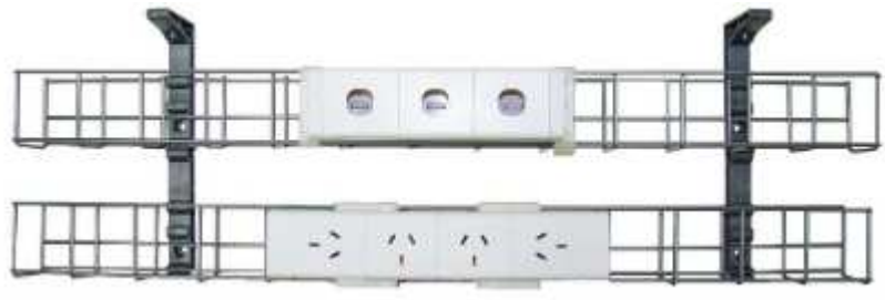
2 Tier shown with WGCD & WGCB Clips, GPO & Data tiles (not included)

CMS have now released a new 50mm flexible cable management basket with two new vertical mounting brackets, which allows the installer to switch between a two tier basket to a single tier basket.