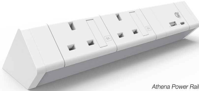
Athena Power Rail w/ Inline USB-C 30W module