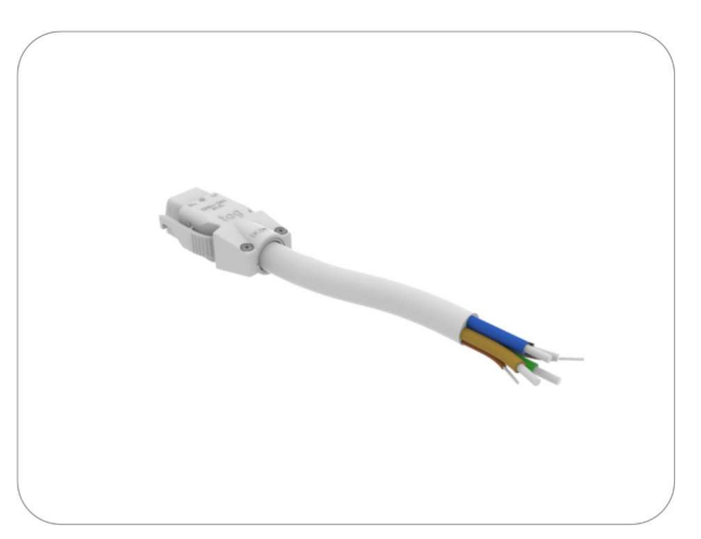
QC3: Light lead - supply lead out of light-fitting 6 x 1.0mm², max 2.5m length