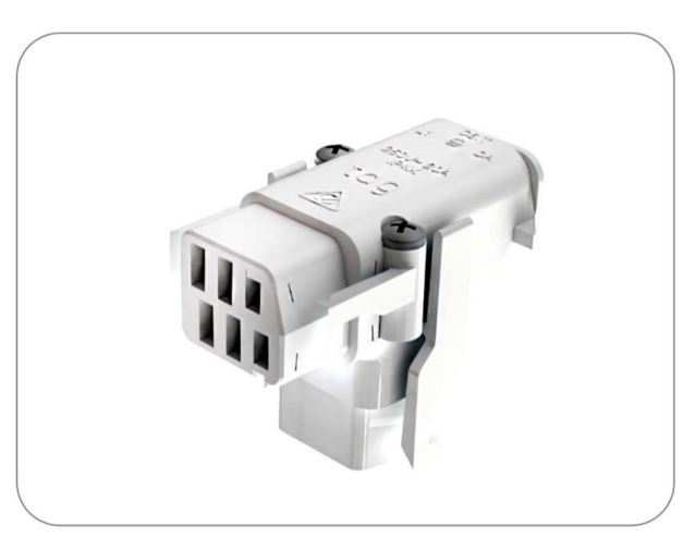
C6T: 'T' Adaptor 1-In 2-Out C6 Connector