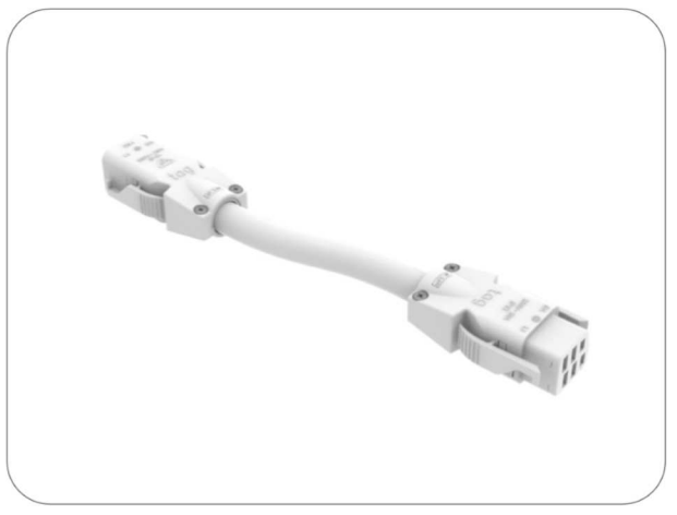
QC2: Interconnecting Lead, 6 core, 4 x 2.5mm<sup>2</sup> & 2 x 1.5mm<sup>2</sup> Dali, Socket to Plug