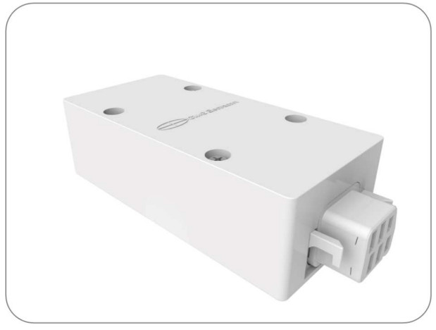
QC1: Starter socket - Transition between hard and soft wiring tunnel terminals to socket.