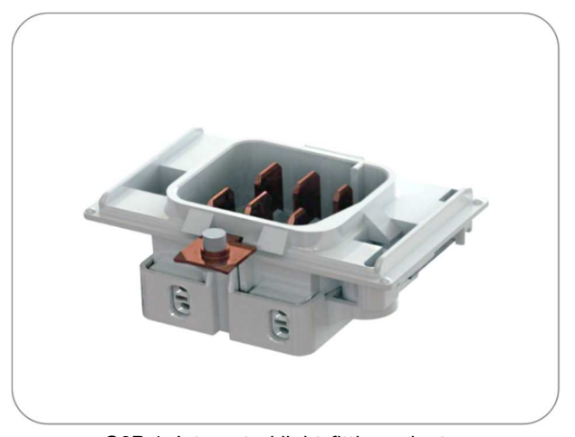
C6P.1: Integrated light-fitting adaptor