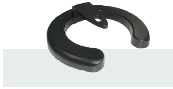
CQB Floor base c/w joiner