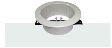
CQCD Cirqlate In-Desk Flange c/w under desk mounting bracket