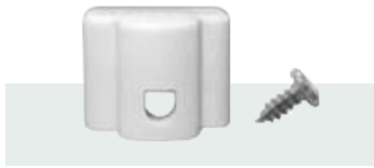
CXDWT Mounting Foot for under desk mounting