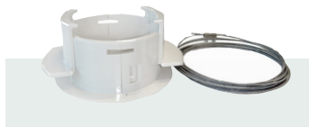
CQC** Ceiling flange, 2000mm hanging wire and terminal block.