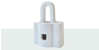
CQH Top hook for false ceiling mount (White Only)