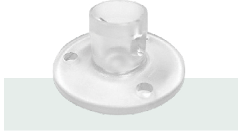
CQDCL Mounting Foot - Clear