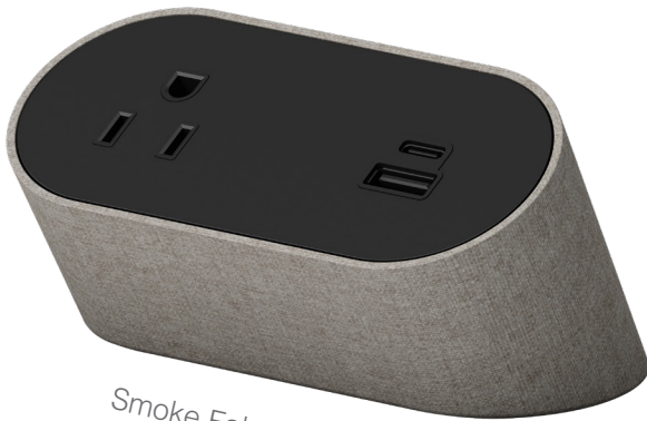
Smoke Fabric Wrap