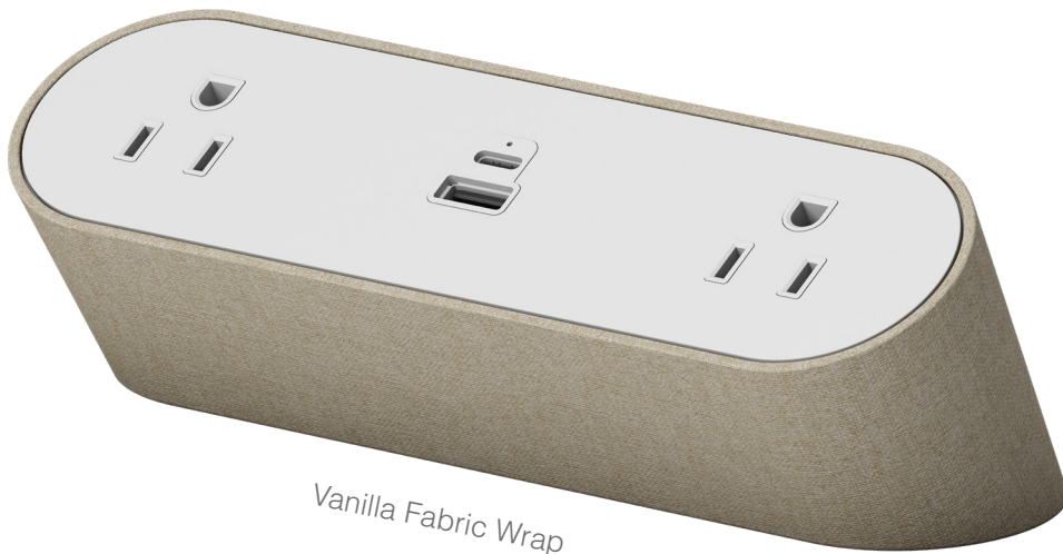
Vanilla Fabric Wrap