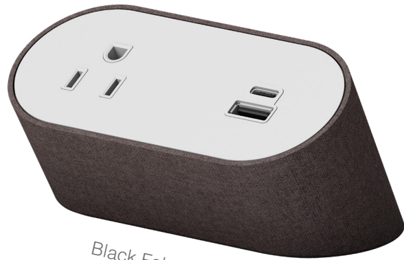
Black Fabric Wrap